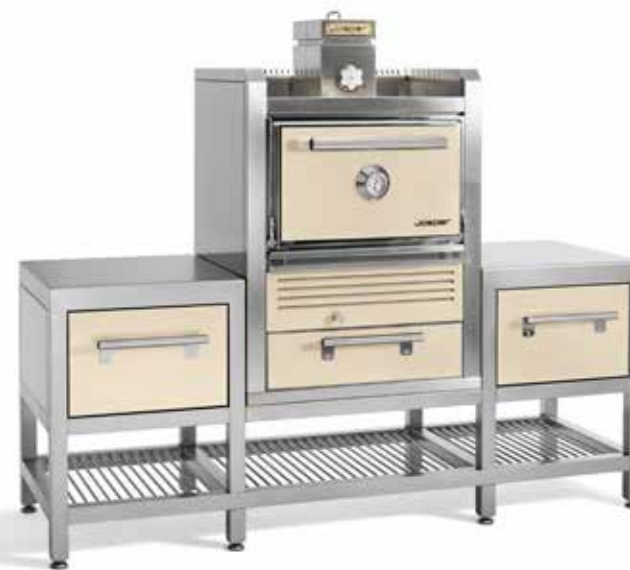
HJA-PLUS-S80-AT CASA MESA