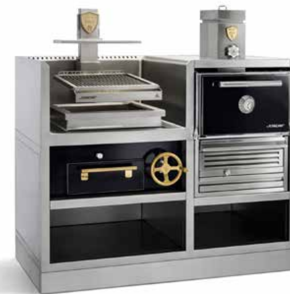
CVJ-50-1-PRO-S80 CASA COCINA