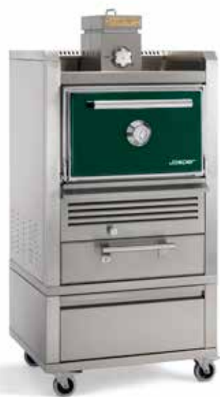
HJA-PLUS-S80-T CASA TORRE