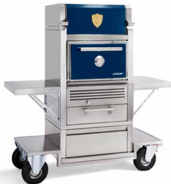
HJA-PLUS-S80 CASA CARRO